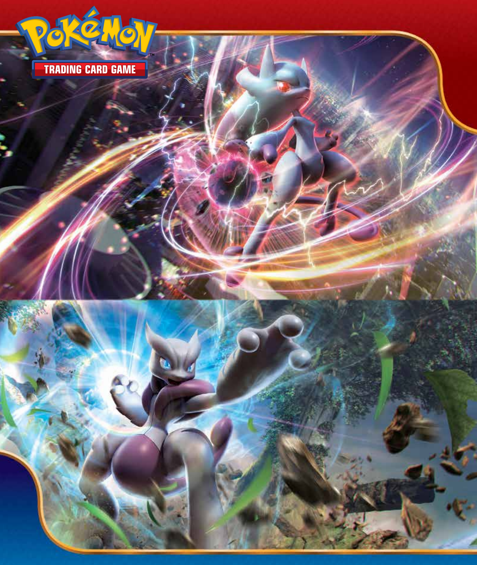
Pokémon Trading Card Game Rules