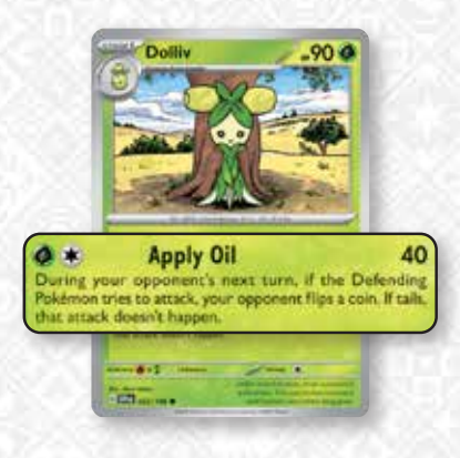
Dolliv's Apply Oil attack affects Call for Family, but not Busybody Nurse.

For example, Squawkabilly's Call for Family attack does no damage, but it's still an attack! Anything else is called an Ability or something else. For instance, Blissey's Busybody Nurse Ability might let your Active Pokémon recover from all Special Conditions, but it doesn't count as an attack.