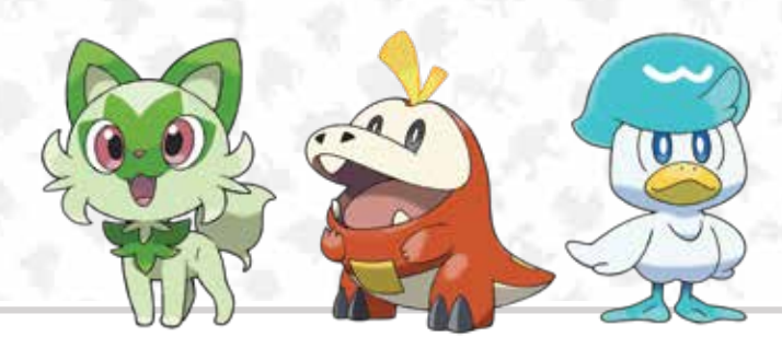
You are a Pokémon Trainer! You travel across the land, battling other Trainers with your Pokémon, creatures that love to battle and that have amazing powers!